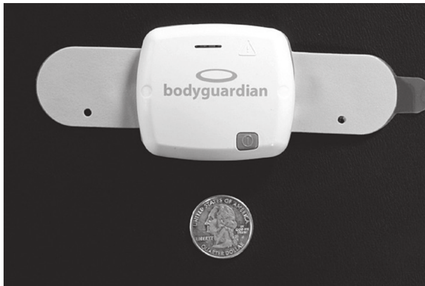
Figure 1: The BodyGuardian device