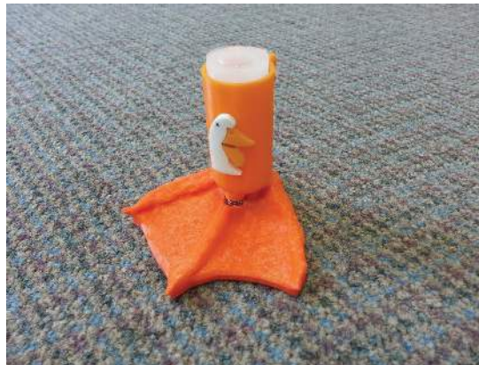
Figure 3: Charlie's new plastic foot